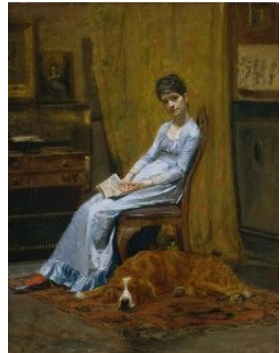
The Artist's Wife and His Setter Dog (1884-89), Thomas Eakins