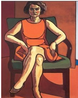
Temma in Orange Dress (1975), Leland Bell